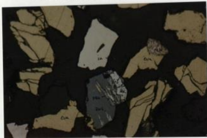
Kuva 14. Bidjovagge, Norja; rikaste +74 \mu\text{m} 2-4.10.86 (P13523). Pyriittiä (SK) ja sinkkivälkettä (ZNS) rikasteessa. Suurennus 175x.