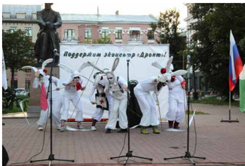
A concert in support of «Dront», in Nizhny Novgorod.