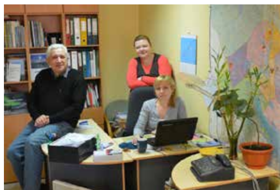
The staff of Bellona Murmansk.

According to the Ministry, Bellona also «pro-