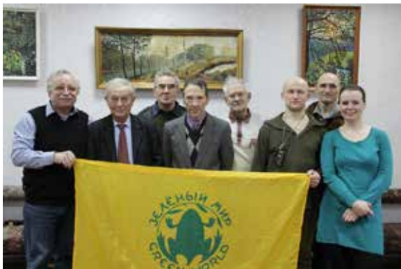
Green World annual meeting.

Naturvernforbundet's partner Green World (GW), which has its basis in Sosnovyj Bor outside St. Petersburg, received on the 16th of November a 42 page letter from the Ministry of Justice, which informed that GW were about to be registered as Foreign Agents. On Friday 20th, the GW case went through a juridical assessment in the Consolation board in St. Petersburg, and the "verdict" was made formal. 2nd of December Green World appeared in the register of Foreign Agents. The level of fines will be decided by the local court in Sosnovyj Bor later.