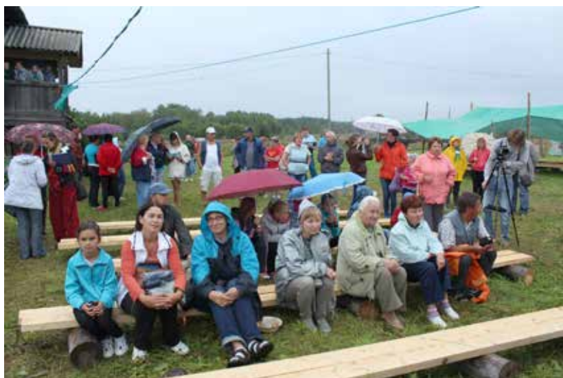
A meeting in the «Northern Environmental Coalition» in the Republic of Karelia.

After that Sakhalin Environment Watch returned 159 000 USD to the Hollywood actor Leonardo DiCaprio foundation, funding that was granted for preservation of the «East» nature reserve. They also returned other grants with the purpose to be excluded from the register as Liberal Mission did. If that will not happen they will close down, the SEW leader declared.