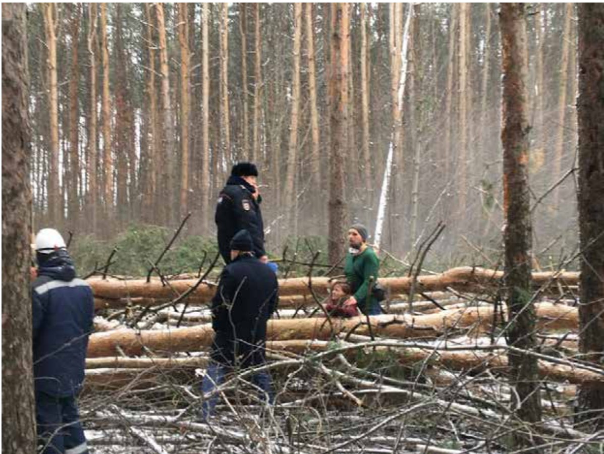
Clashes with the protectors of forests from deforestation for the construction of residential complex, Izhevsk, 12.11.2020.

Unfortunately, this (...) gives carte blanche to law enforcement officials who subscribe to conspiracy theories. After all, honors and promotions are not given to officers for catching polluters of the air and water, but to those who expose unregistered organizations that spread criticisms of the government's environmental policy.