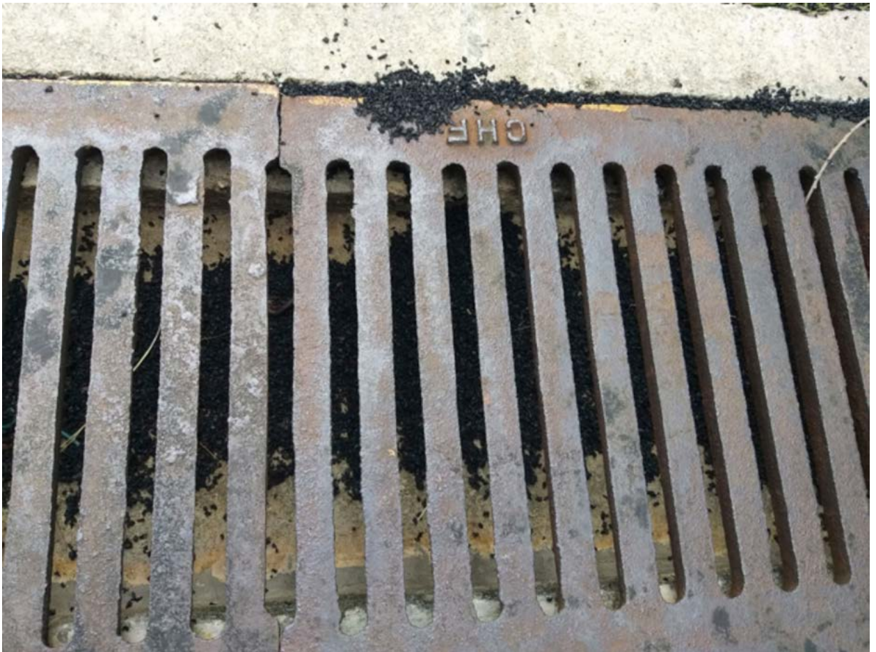
Figure 2b – Infill entering a drain at a pitch in Hong Kong, local to the recently discovered rubber crumb on the beach.

Most studies assume that not all of this ‘lost infill’ necessarily leaks to the environment, as some enters the waste stream and some potentially stays on the pitch through compaction or redistribution 7 . One recent desk-based study used mass-balance calculations comparing monitored losses from field studies to the total weight of infill top-up to suggest that up to 75% of infill top-up is due to compaction 8 . Another recent pilot study by Ecoloop claims that mitigation measures can effectively reduce emissions to zero 9 . Both studies were commissioned by tyre recycling organisations and were limited in scope. We consider these revised figures are likely to be under-estimating loss for the following reasons: