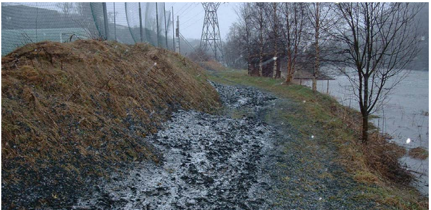
Figure 1. Infill loss from pitches can be extreme in some cases leading to acute pollution of the local environment. This image from adjacent to a field in Norway shows black infill build-up following snow removal.

Third generation (3G) artificial pitches use performance infill to make a more comfortable playing surface, loose elastic granules that are added between the ‘grass’ filament pile. In the vast majority of cases this infill is made of microplastic 1 , often a rubber crumb made by grinding up end of life vehicle tyres (ELT). Using loose microplastic in an outdoor setting clearly creates a risk of microplastic pollution to the environment. This risk was only recently recognised meaning potential alternatives and technical mitigation techniques are only starting to be investigated. We know that infill can be lost from pitches by being carried off by players, migrating from the edges of the pitch into local surroundings, or entering drains and waterways. Storage and transport of granules, installation, removal and treatment of waste pitches all represent additional risks of pollution. Limited quantitative studies mean estimates of loss are variable and hard to constrain, but losses are evident at most pitches and there is sufficient evidence to suggest quantities are significant compared to other sources of microplastic pollution across Europe 2 . Knowing the potential hazard of these microplastics to soil, freshwater and marine water environments, action is needed to prevent this source of pollution.