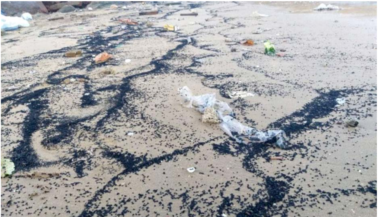
Figure 2a Rubber crumb material washed up on a beach in Hong Kong, suspected to originate from a nearby pitch.

Initial estimates of infill loss have been made by examining the total quantity of infill that is required to be 'topped up' each year at an individual pitch 4 . Microplastic pollution from pitches is well-documented. Field studies indicate that it is not unusual for several hundred kilograms a year to migrate from the edge of pitches into nearby soil & grass, with infill regularly found in stormwater and local watercourses. Particular practices, such as poorly managed snow removal, have led to far greater losses and larger required top-ups over a single season, with clear evidence of pollution of local land & aqueous ecosystems (Figure 1) 5 . However, major losses are not limited to cold climates; a recent suspected spill event in Hong Kong (Figure 2a) has led to hundreds of kg of material washing up on a coastal bay 6 , with nearby pitches discovered to be losing infill directly to drains (Figure 2b).