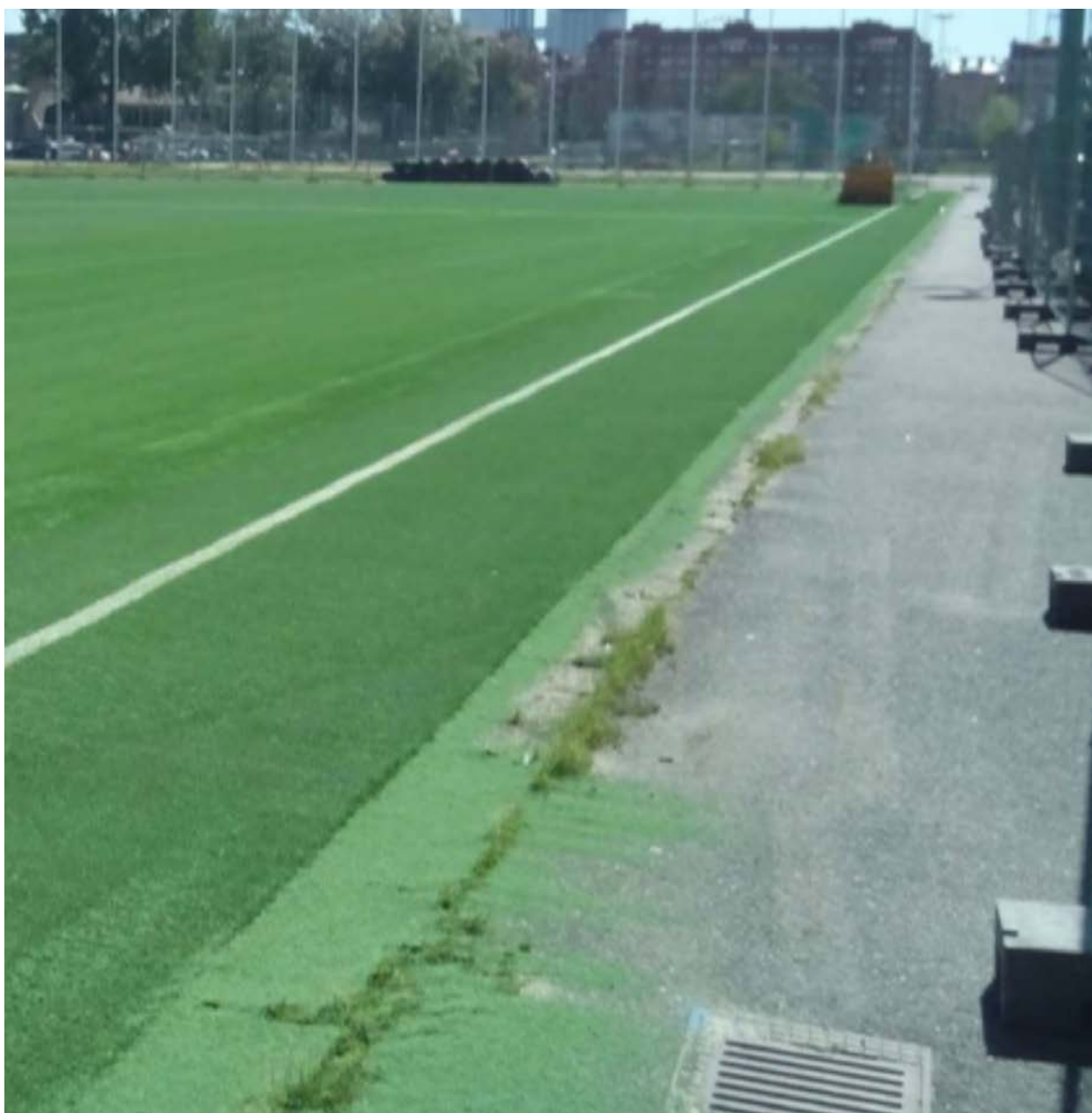
Figure 3 EPDM granules (green) near a drain shortly after installation of a pitch.

Appendix A provides a table of reviewed studies, the estimates of loss they give and key notes regarding methodology.