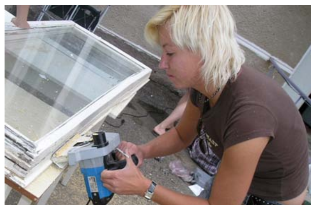
5 Insulating windows in Ukraine.

A fourth area for technology transfer is chiefly applicable for low-cost, simple technologies at a household level. This is the dissemination of information about low-cost, simple energy technologies, which goes hand-in-hand with efforts to change attitudes towards energy use and sources of energy in the population. This requires people and resources, and may be seen also as a pre-requisite for successful transfer of more complex technologies, as