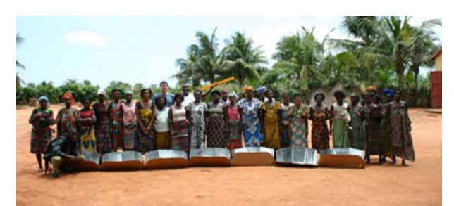
3 Workshop on solar cookers.

".....the sum of knowledge and tools that increases the human ability to transform nature. Such transformation may have a productive goal – to increase human satisfaction of needs. It may also be used in a destructive manner, to increase the destructive power in war. "<sup>8</sup>