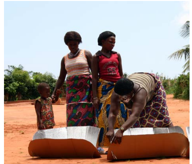
2 Making solar cookers in Togo.

On the other hand, UNDP has already helped to prepare an increase of technology transfer. One of the most important is the funding of reports in many developing countries for the assessment of technology relevant for developing countries in a climate context and the technology needs for specific countries. One example is a report prepared in Ghana.<sup>6</sup>