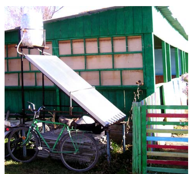
7 Using the sun to heat up water in Kyrgyzstan.

An example of how a NGO can provide information service for a technology transfer project run by others is given in Appendix A - District heating renovation .