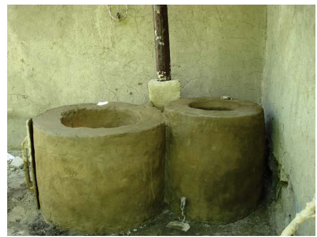
4 Efficient cooking stoves in Tajikistan.

Villages also have other energy service needs such as transportation, cooling of vaccines and medicines in village clinics, running PCs, etc, but they are not described in detail here.<sup>vi</sup> Electronic communication, in this case connection to cell phone services is discussed in part 11, using the example of Villagephone in Bangladesh.