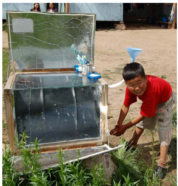
6 Boy enjoying warm water from a solar heater.

A basic problem is how one can scale up successful projects, and at the same time be able to adapt to different local cultural, economic and ecological circumstances. In the article, Calder describes several different approaches, and concludes that all of them have their merits. However, one method does not fit all circumstances. His article refers to many successful examples of how to scale up projects that has been successful in bringing the services and goods to the local population. Calder underlines that to be truly successful, such projects also have to become rooted in the local community.